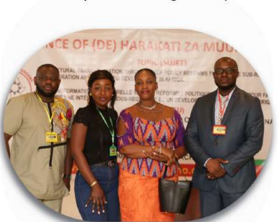
Women Affairs Director (third from left) with delegates from Senegal, Togo and Benin