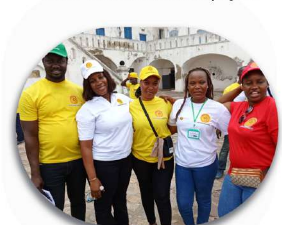
Women Affairs Director and delegates from Sierra Leone at Cape Coast Castle