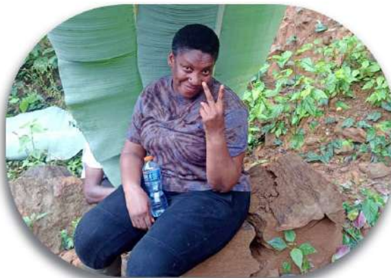
CEO of Danqsi Farms during field supervision