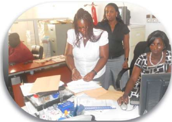
CEO of Consika Ltd. with employees